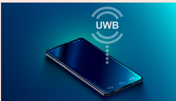
FIGURE 2: UWB Applications

Frequency drift or instability in the oscillator can lead to signal distortion and poor performance, so choosing a crystal with the correct frequency range, tolerance and stability is critical. Other key parameters include package type, operating temperature and load capacitance.